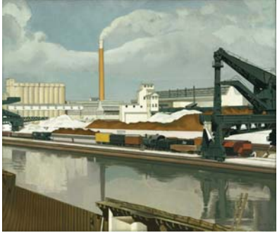
Theme: Landscapes American Landscape, 1930 Charles Sheeler 1883-1965